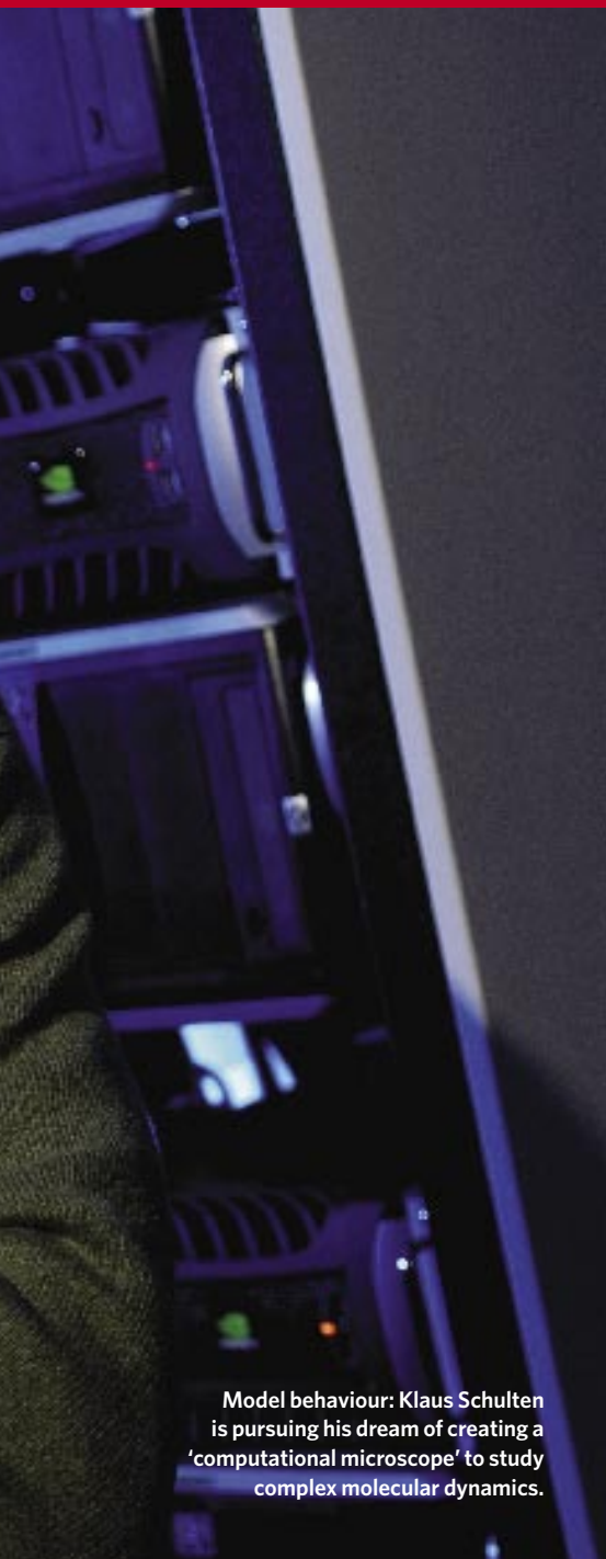
Model behaviour: Klaus Schulten is pursuing his dream of creating a 'computational microscope' to study complex molecular dynamics.

The numbers shocked Schulten, who believed his team was on course to simulate molecular dynamics on the scale of milliseconds — longer than anyone had previously achieved. Even with cutting-edge programs such as Desmond and NAMD, scientists have been able to glimpse only the fastest-folding proteins, such as the villin headpiece, which folds in about 10 microseconds. The number of possible configurations of atoms in larger molecules, over time and in three dimensions, is astronomical. If these kinds of simulation could be sped up 1,000-fold, which even then could take a month of computing time, the pay-off could be high. They might, for instance, reveal binding sites for new drugs to tackle a wide range of medical problems.